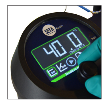
Select test temperature