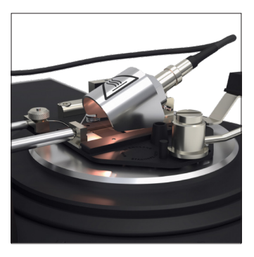
Automatic dip of ignition source and flash detection