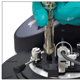
Inject 2ml sample