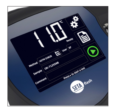
Select test temperature