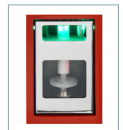
Less than 50ppm

FIJI is the only test that can screen for all types of FAME.