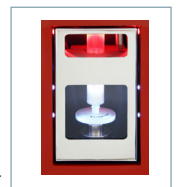
More than 50ppm