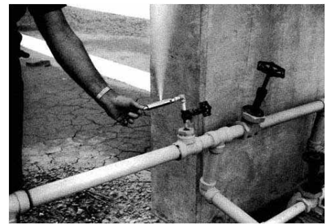
Valve Applied to Transfer Line