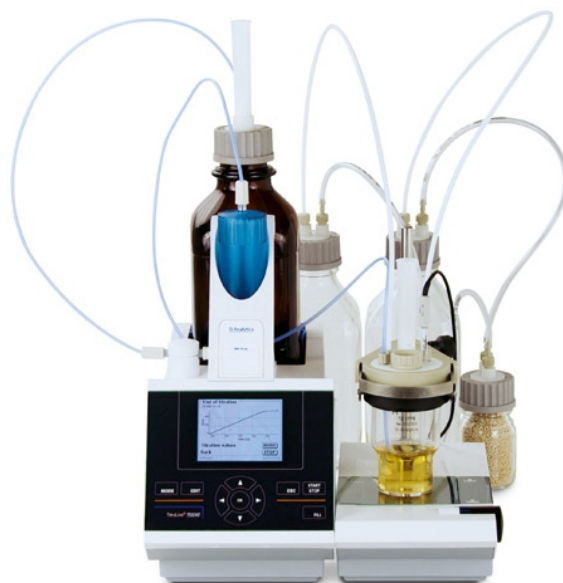
Titramax VT WATER

At the end of the measurement, results are shown in ppm water or several other units.