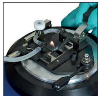
Dip the test flame, flash detection is automatic