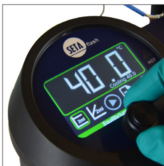
Select test temperature