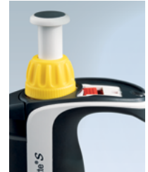
Easy Calibration™ technology

Provides a comfortable and secure fit in all hands – right, left, big or small