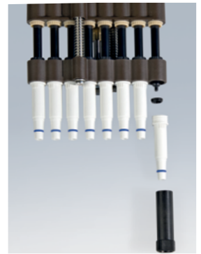
Individually removable nose cones