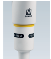
Integrated shaft coupling